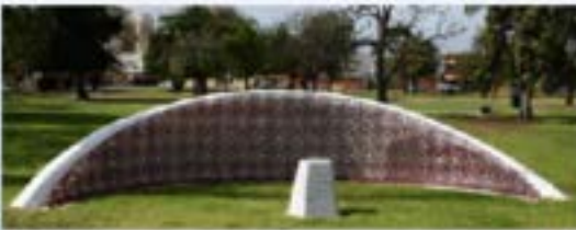
City South Association Inc Strategic Plan 2024-2025 June 2024